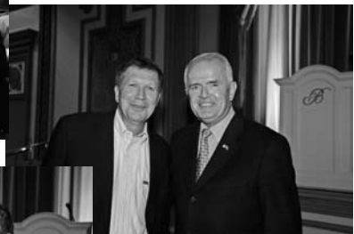
Nevada Governor, Jim Gibbons, greets Mr. Kasich at the 2009 NDA Annual Luncheon.