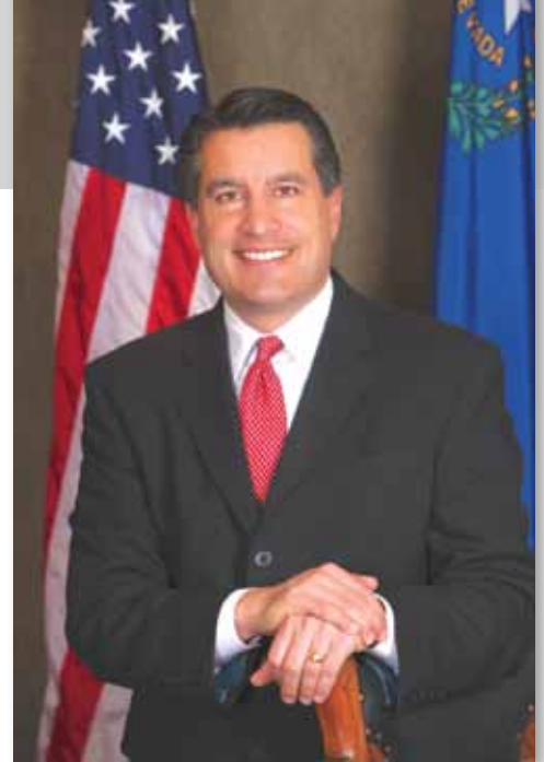
Brian Sandoval, Governor of the State of Nevada

Includes one (1) table of 10 at luncheon; reserved seating; distribution of promotional materials to every attendee.